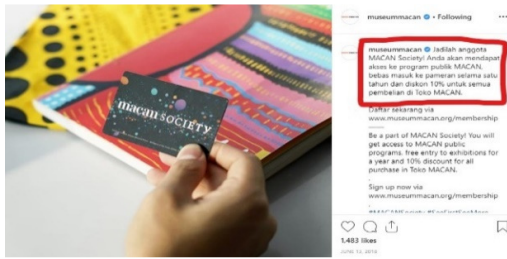
Fig. 3. Membership Package Program