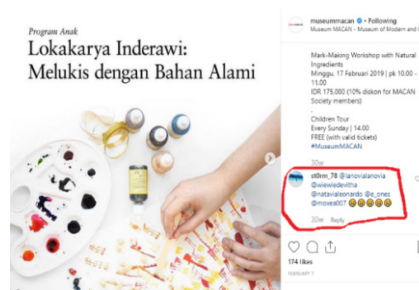
Fig. 2. E-Word of Mouth by tagging their friends' accounts