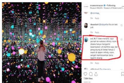
Fig. 1. Comments' on follower's feeds of Museum Macan

The last component of tourism destination is available packages in which the management party informs it through its Instagram account that there is a membership program where the visitor that becomes the member can enter the public space freely for one year. Besides, every goods purchasing in Museum Macan Souvenir Shop will get discount from 5 to 10%. In addition, the other package is the visitor who spends night at The Gunawarman Hotel will get free entrance to Museum Macan .